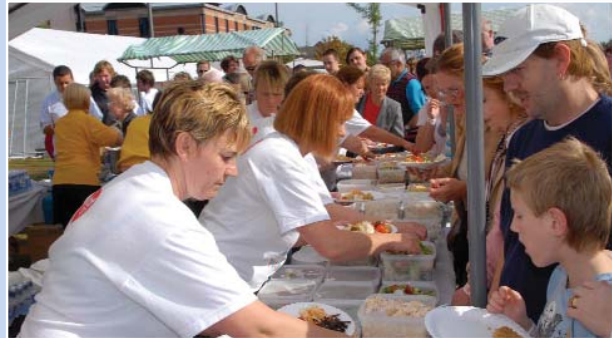
Local communities coming together in Designs of the times project in the NE

If design smacks of frippery and excess in the face of social fragmentation, economic hardship or cultural malaise, then a design-led policy for urban regeneration might sound even more far fetched. However, policies have still to be experimented, debated and evaluated. In new product development the design phase is generally understood to absorb 15% of the production budget, but it commits 80% of overall costs. The measurement of 'cost' might be different, but it would be interesting to speculate whether a similar ratio is applicable in regeneration terms.